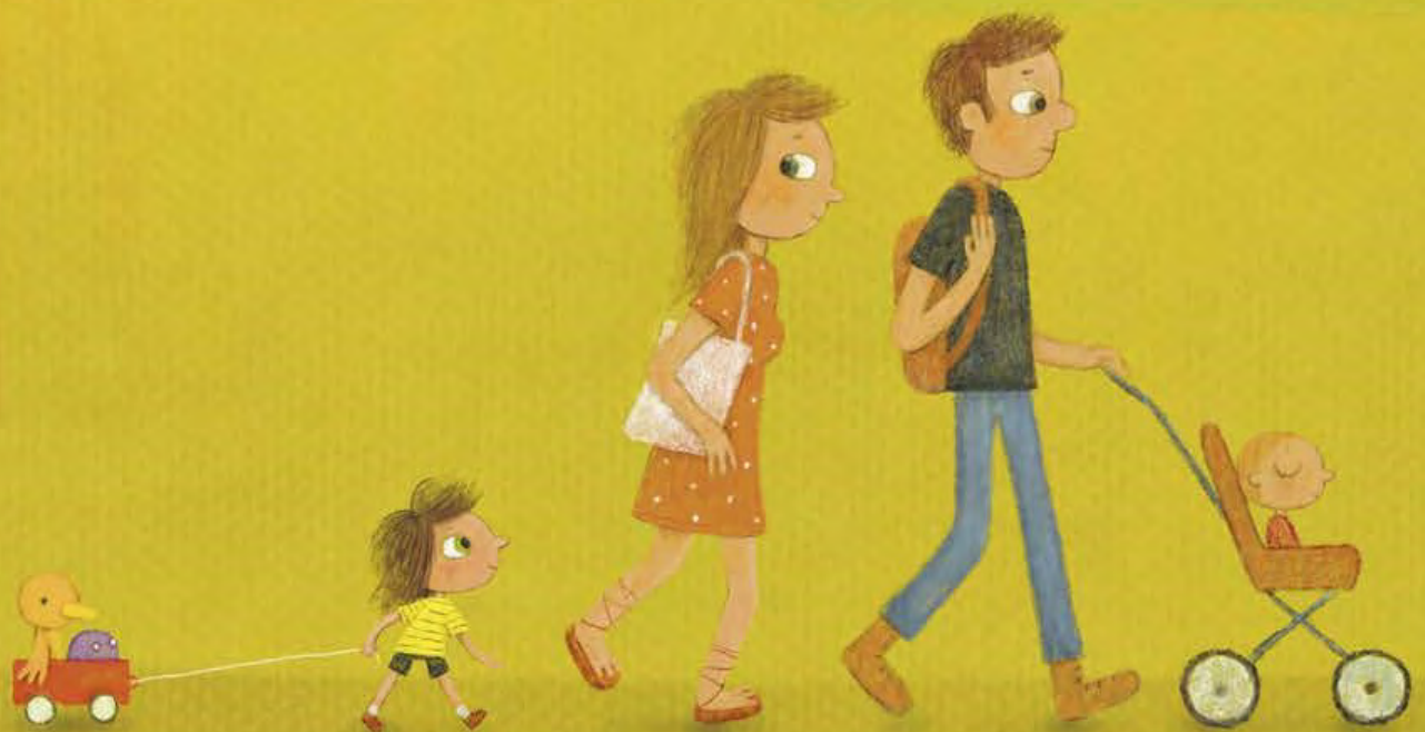
Illustration by Aiju Salminen